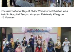
The International Day of Older Persons' celebration was held in Hospital Tengku Ampuan Rahimah, Klang on 15 October.

About 300 people attended the webinars listening to common geriatric problems shared by doctors and allied health professionals. Prizes were presented to winners of quizzes at the Pandamaran Health Clinic during the closing ceremony in early November.