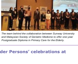
The team behind the collaboration between Sunway University and Malaysian Society of Geriatric Medicine to offer one-year Postgraduate Diploma in Primary Care for the Elderly.