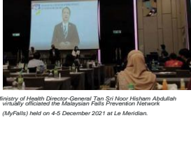
Ministry of Health Director-General Tan Sri Noor Hisham Abdullah virtually officiated the Malaysian Falls Prevention Network (MyFalls) held on 4-5 December 2021 at Le Meridian.

The organisers believe that the involvement of experts across multiple disciplines of elderly healthcare creates awareness on falls among older adults.