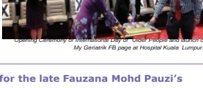
Opening Ceremony of International Day of Older People and launch of My Geriatrik FB page at Hospital Kuala Lumpur.